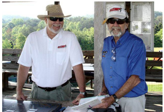
Here are a few scenes from the activity at KCRC field during the SPA contest from Gary Lindner. More on pg 5