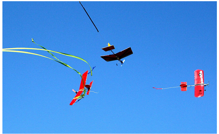
Illustration 7: Just an example of what Derby Combat is all about.