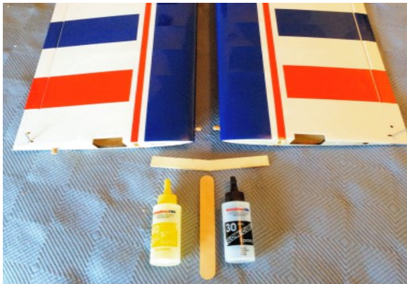
Figure 6 shows the wing brace and other materials layed out ready for the gluing. The use of 30-minute epoxy allows time for the glue to be spread all over the ends of the wing panels as well as inside the box for the brace, and on the brace itself. Once the epoxy is spread around, the brace is inserted into one panel and the other panel is pushed onto the brace and against the end of the first panel.

Having glued the CA hinges and the aileron control rods together, we are ready to assemble the wing panels into a wing. The V-shaped dihedral brace, so a naïve builder would know what it is for, was taped to one end of a wing panel. Figure 3 pictures the inner ends of the wing panels (the ones to be glued together). The paddle between the bottles of epoxy is to mix and apply the glue – it is wider than the usual popsicle sticks often used, and is better suited to ladling on epoxy and spreading it around.