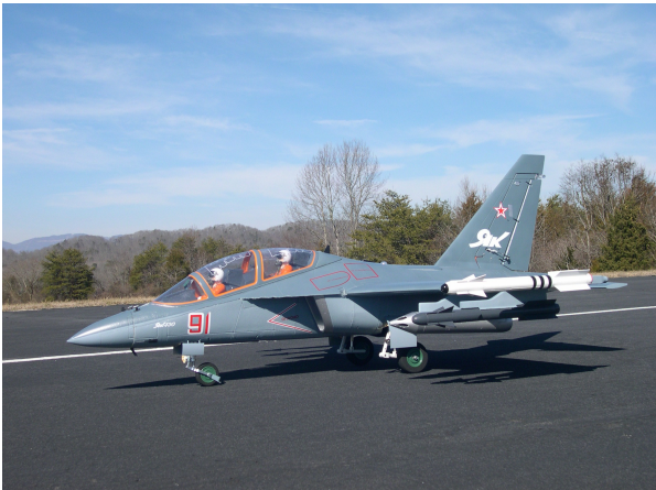
Illustration 2: This is the Yak-130

Getting back to logic, the quality of edf's is getting much better because several of the leading companies are in serious competition. Foam does not really look so much like foam anymore, but still is easy to repair. Many scale details are now being included, both on the exterior of the plane and in the cockpit. The Russian YAK-130 I brought to the November meeting is a good example of the kind of detail being added