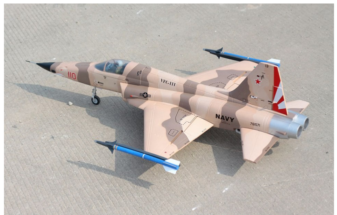
Illustration 1: This is the F-5

As a next step up I like Freewing's 80 mm fighters, most selling for about $299 PNP. This includes the F-86 Sabre, the de Havilland DH-112, the A-6 Intruder, the Mirage 2000C-5 fighter, a desert camo F-5, and a Swiss Scorpion. Scale details are superb, and they all fly great. Their speed is generally around 80 to 90 mph, except for the Mirage and the F-5, which are a little more difficult to fly and considerably faster (110 mph plus).