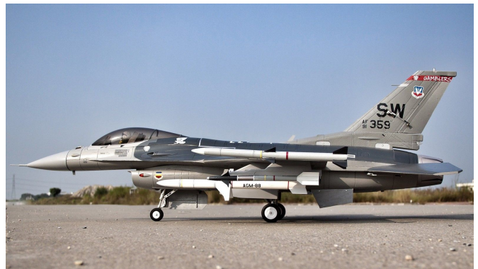
Illustration 3: This is the Freewing F-16.

Testing is extensive. For example, the new Freewing 90mm F-16 edf was extensively tested by Motion RC (Freewing's US distributor) and their suggested modifications were made before it even went into production . Testing included about 200 flights under all conditions including heat, rain, and wind. Since the gear on the model F-16 is very complex (just like the real one), it was extensively torture tested. This consisted of 74 flights on one inch tall grass, 29 flights on a grass/dirt/weeds mix, and 22 flights on rolled dirt. Static drop testing consisted of 20 drops, the highest from 32 inches with the jet loaded to 12 pounds (an 8s battery plus extra weights). It is also great that the guys doing the testing on these planes have been available by phone and email to answer questions I had about control settings, flying techniques, etc.