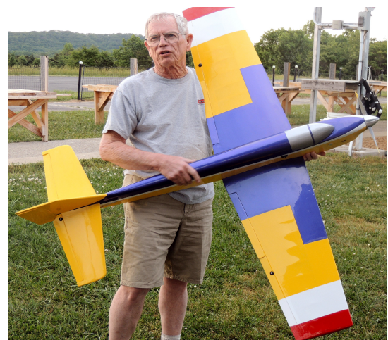
Illustration 2: Bill's Curare