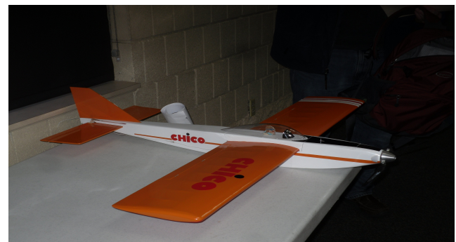
Illustration 1: Michael's pic of the Chico