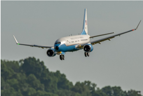
The President comes to KCRC

I wonder if they watched the waterproofing electronics video?