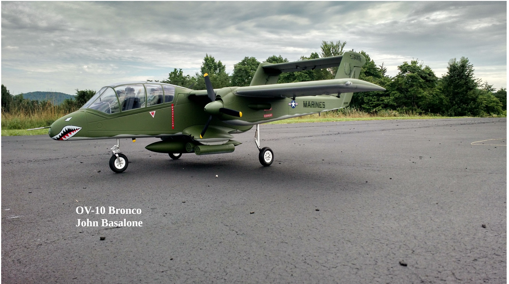
OV-10 Bronco John Basalone