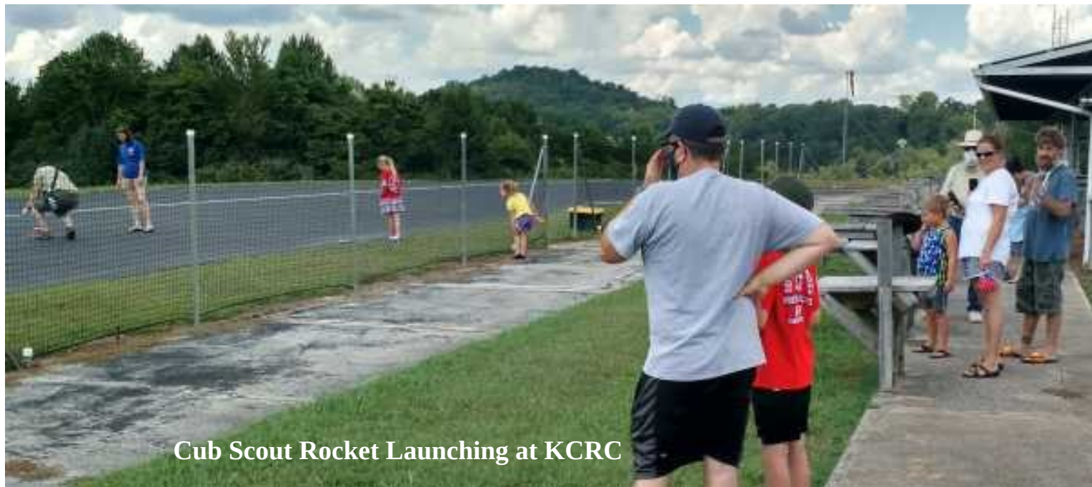
Cub Scout Rocket Launching at KCRC