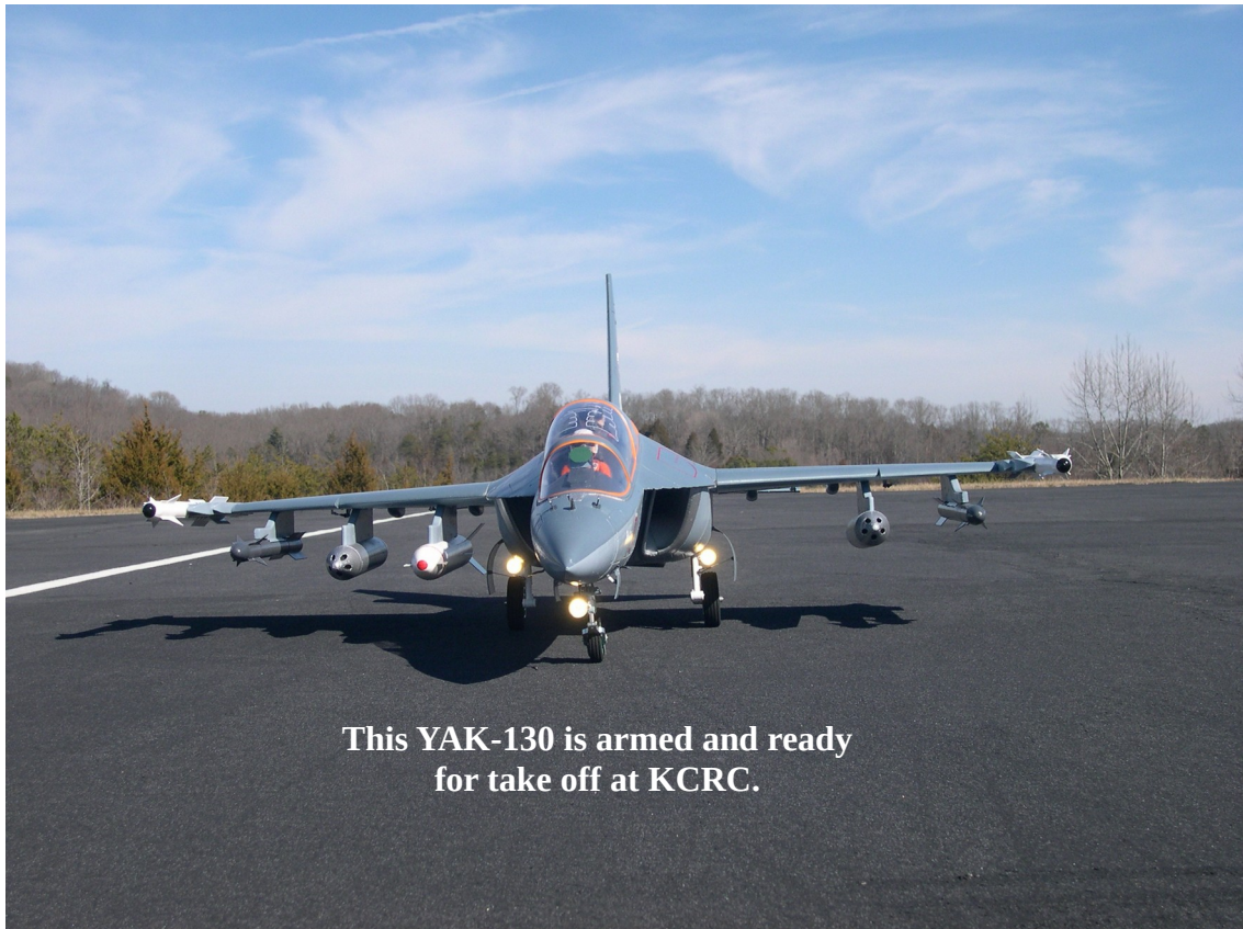
This YAK-130 is armed and ready for take off at KCRC.