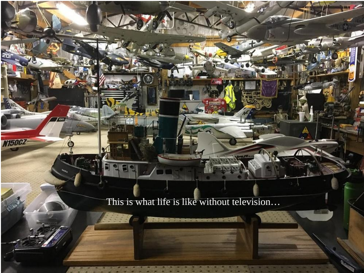
This is what life is like without television...