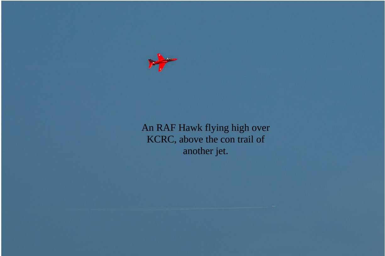
An RAF Hawk flying high over KCRC, above the con trail of another jet.