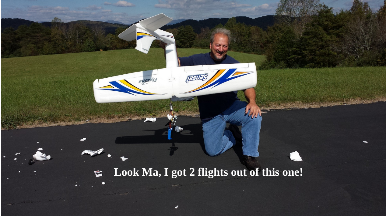
Look Ma, I got 2 flights out of this one!