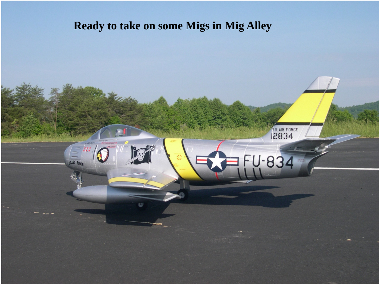
Ready to take on some Migs in Mig Alley