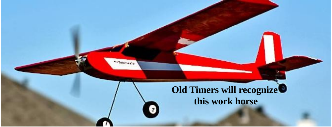
Old Timers will recognize this work horse